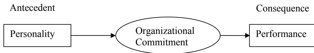
Figure 1: Organizational commitment as a mediating variable