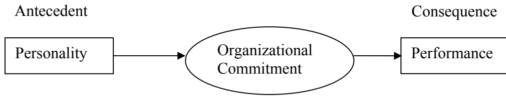
Figure 1: Organizational commitment as a mediating variable