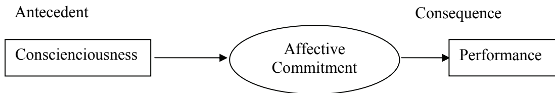
Hypothesis 2: Affective commitment as a mediating variable