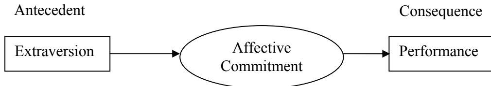
Hypothesis 1: Affective commitment as a mediating variable